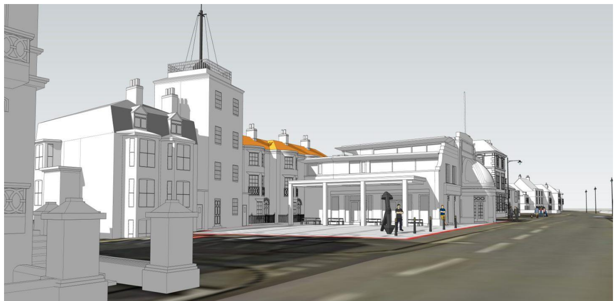
View of the proposals

You may want to register in advance of the session of your choice and ask your questions. The events will last between 30 and 90 minutes, depending on the number of questions received. If you have questions but cannot attend the sessions, you can do so via the website and your questions will be answered.